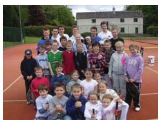
Just some of the kids who took part in last year's Summer camp.